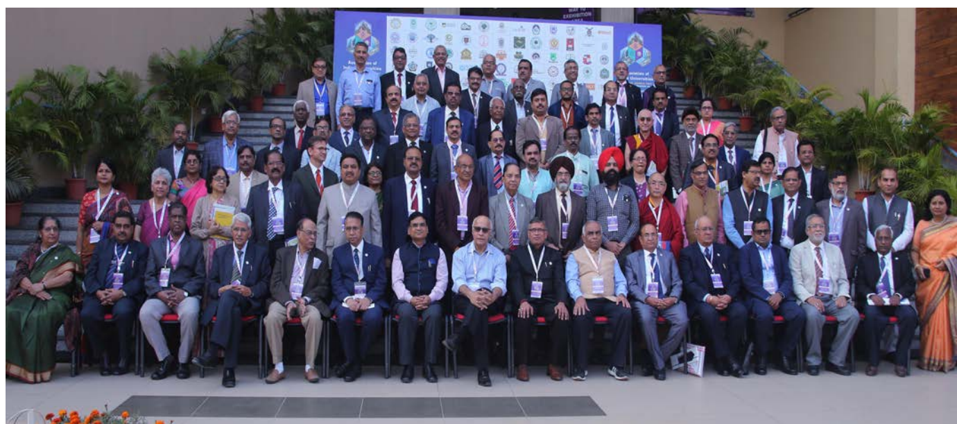
93rd Annual General Meet and National Seminar on Autonomy for Excellence in Higher Education organized by Association of Indian Universities on 16th – 18th February 2019